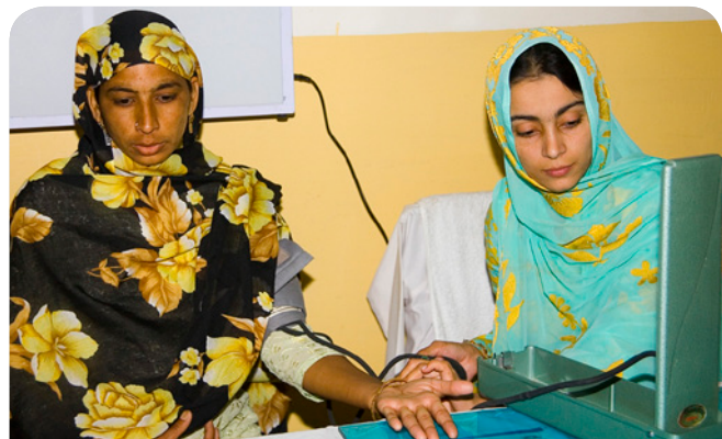
Health worker in Pakistan

The HAF includes six Action Fields (HR Management Systems, Leadership, Partnership, Finance, Education, Policy) and a four-step Action Cycle (Situational Analysis, Planning, Implementation, Monitoring and Evaluation). Each Action Field and Cycle is linked to tools, guidelines, indicators, and resources.