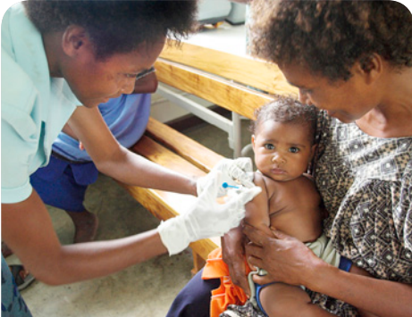
Nurse in Papua New Guinea