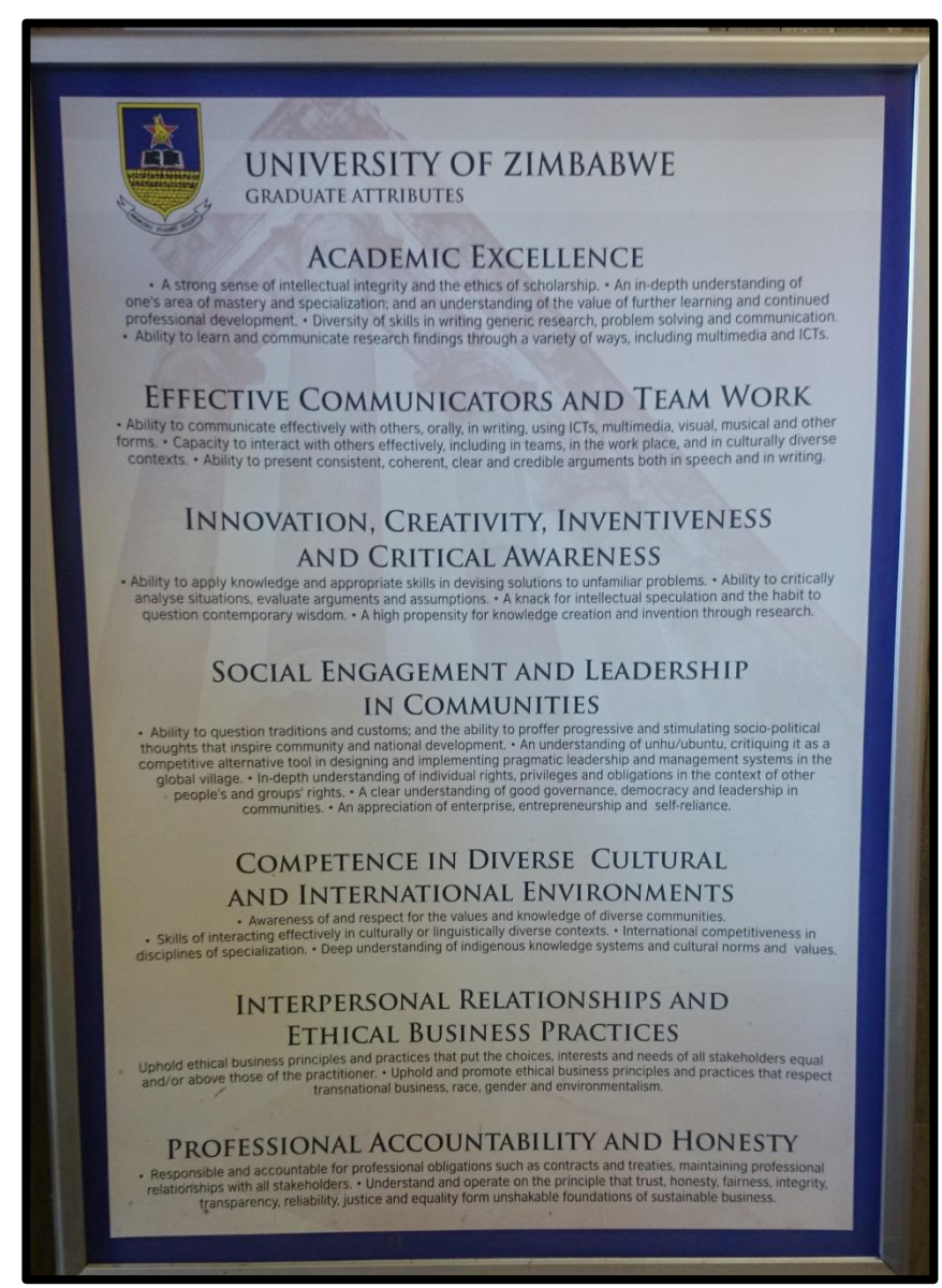
Figure 4: UZCHS Graduate Attributes