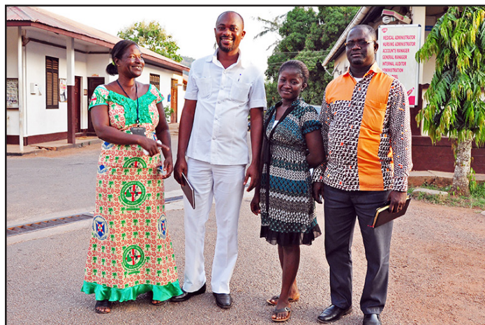
Staff members at Agogo Presbyterian Hospital, a Christian Health Association of Ghana-supported facility.

World Health Organization. 2007. Faith-based organizations play a major role in HIV/AIDS care and treatment in sub-Saharan Africa. http://www.who.int/mediacentre/news/notes/2007/np05/en/